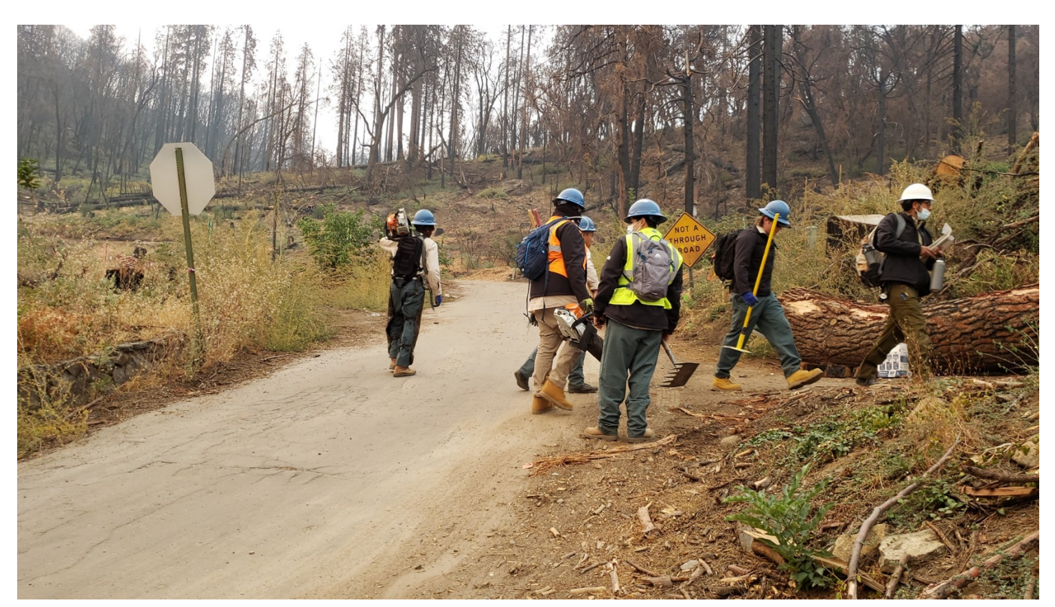
Members of our Chavez Corps assisting with fire clean up in Alder Springs after the devastating Creek Fire.

Brought to you by your FIELD Marketing-Communications Team